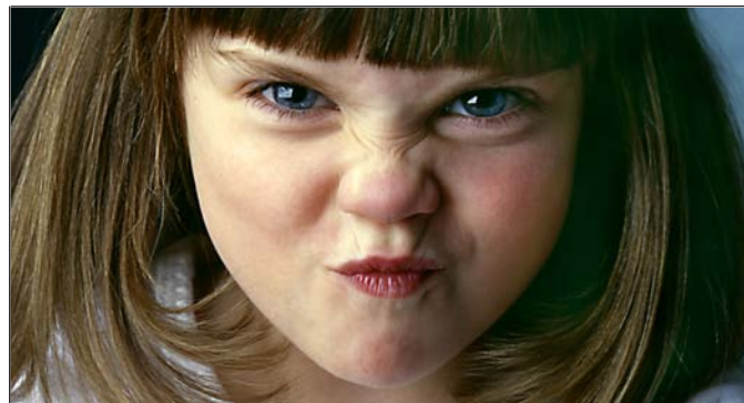
NYCOMED AxMERSHAM / VISIPAQUE

Please visit www.skiphine.com to view more images