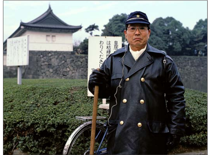
PALACE GUARD / TOKYO